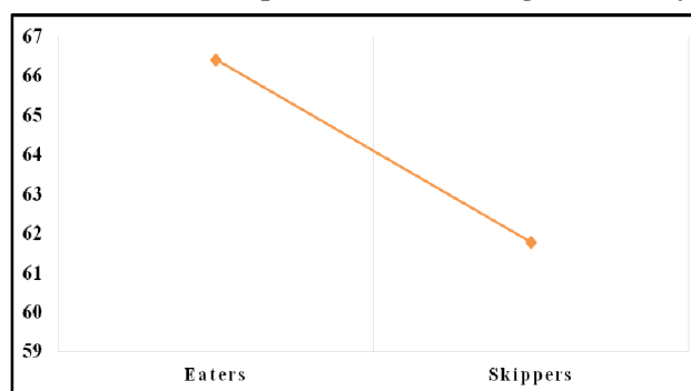
Fig- 3: Mean Score Depicting the Association of Breakfast Consumption Pattern with Memory Capacity

Skipping breakfast is prevalent in school age youth and it has a negative impact on academic achievement. Most of the American youth do not participate in school breakfast programme. High quality breakfast is for youth who are not likely to get good nutrition the rest of the day (Basch, 2011).