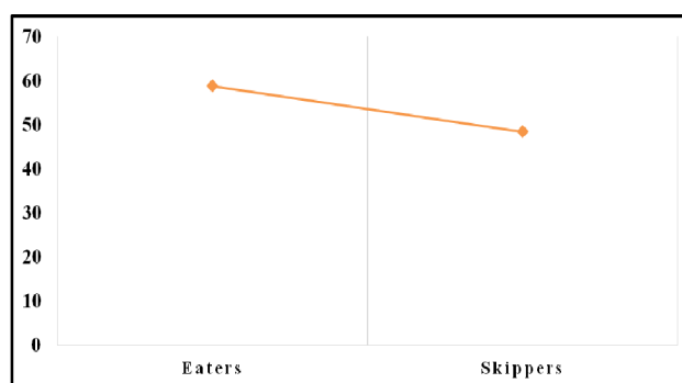
Figure 2. Mean Score Depicting the Association of Breakfast Consumption Pattern with Cognitive Ability

Among the regular eaters, 70.37 per cent had satisfactory cognition while only 29.62 per cent skippers were found in this category. However in the below average category, more regular breakfast eaters (64.28%) were found as compared to breakfast skippers (35.71%). This finding opposes the trends observed in the former categories. On plotting the mean cognitive abilities of regular breakfast consumers against breakfast skippers, the line dropped vertically (58.84 to 48.49) among the regular breakfast eaters as compared to the breakfast skippers (Fig-2). Hence, in the present study, skipping breakfast has been shown to pose a negative outcome on cognition of the study subjects. A significant difference (p value 0.026) was observed when the cognitive abilities of regular breakfast eaters were compared to that of skippers.